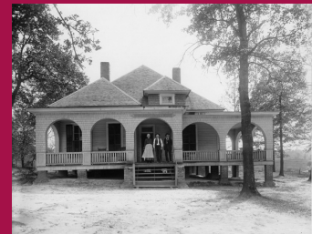
Blue and Grey Cottage

Admission is $2 per person and the program will take place inside the museum. Call 205-755-1990 for more information.