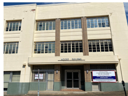
Historic Moore Building downtown Montgomery

The building retains its original steel windows, corridors, staircases, elevator and Art Moderne motifs. Phase I of a multi-phase rehabilitation project includes site work, roof repairs, hazardous material abatement, and demolition of non-original material. Once the project is complete the first floor will be used to support the operation of the Freedom Rides Museum with additional educational, programming, retail and office space.